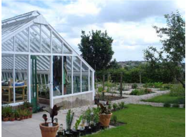
Victorian glasshouse and formal garden

Discover how it has changed over time from common ground to Victorian leisure gardens and from working-class allotments to community resource.