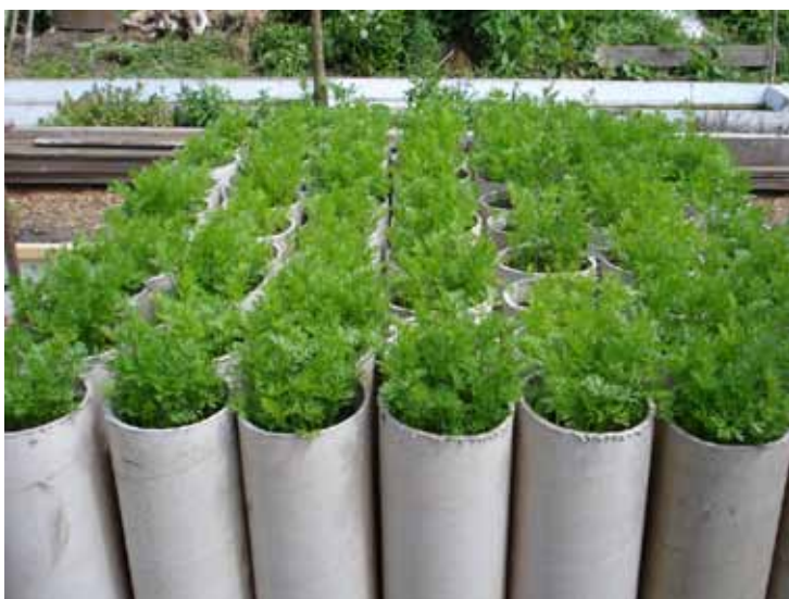
Carrots being nurtured

Find out about the different types of people who have leased plots over the centuries, the things they liked to grow and how gardening has changed.